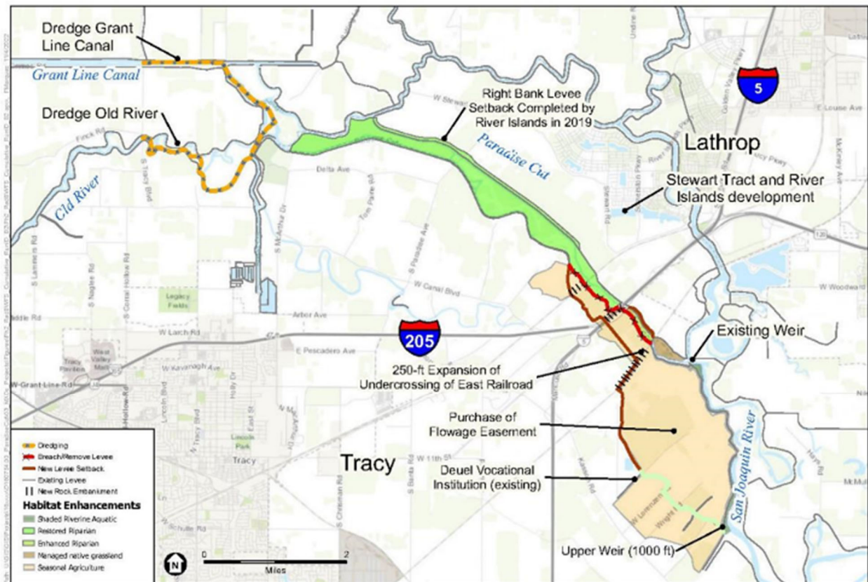
Figure 1: Location of the Paradise Cut Bypass Expansion and Multi-Benefit Project Features as part of Conceptual Project Design.